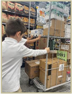
Force of Pushing

In support of the “How the World Works” Theme which revolves around the idea that forces move objects, KG students made a visit to Tamimi Markets during the 10 th week of the 1 st trimester. The trip supported the research and inquiry regarding the impact of forces on subjects around us and helped the students to discover different kinds of forces.