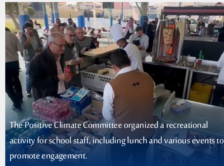
The Positive Climate Committee organized a recreational activity for school staff, including lunch and various events to promote engagement.