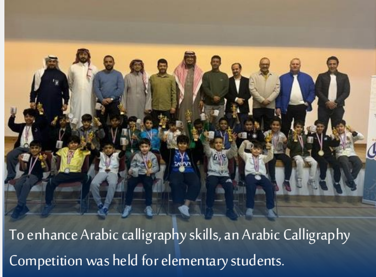
To enhance Arabic calligraphy skills, an Arabic Calligraphy Competition was held for elementary students.