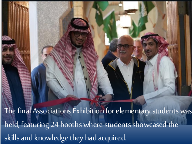
The final Associations Exhibition for elementary students was held, featuring 24 booths where students showcased the skills and knowledge they had acquired.