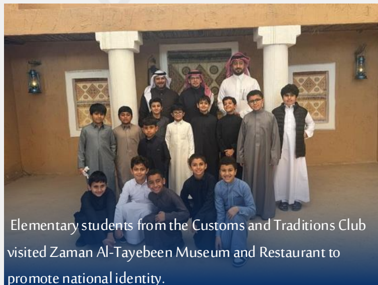
Elementary students from the Customs and Traditions Club visited Zaman Al-Tayebeen Museum and Restaurant to promote national identity.