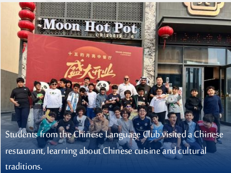
Students from the Chinese Language Club visited a Chinese restaurant, learning about Chinese cuisine and cultural traditions.